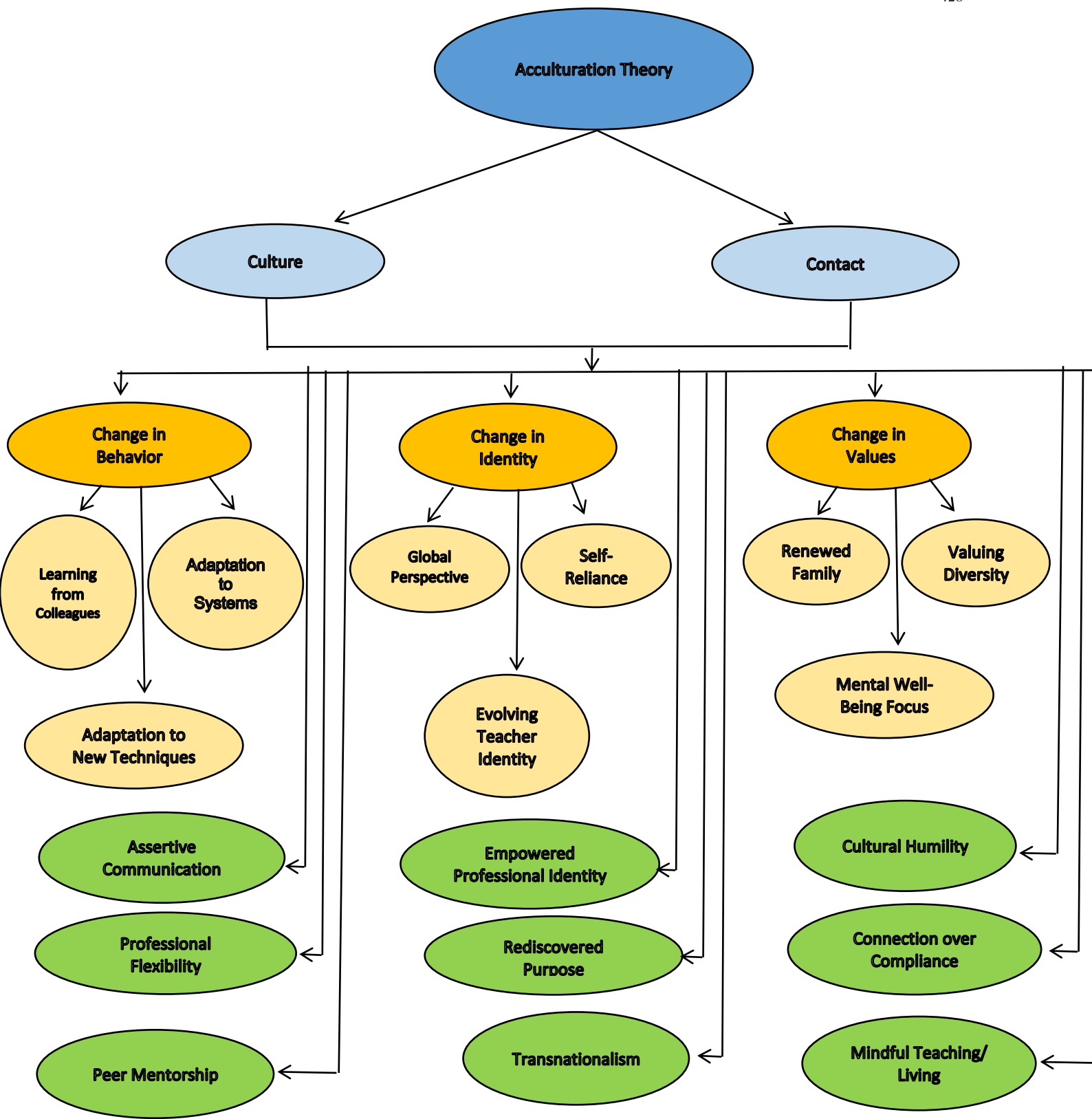
Figure 2. Modified Paradigm