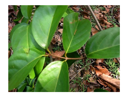
Figure 1. Leaves of Polipog Vine

Salacia korthalsiana Miq is generally a climbing shrub with woody stems that twine into the surrounding vegetation. There are two types of Polipog; the tree from which large branches and grows abundantly in deep forest. Its roots are big. The other one is a vine from with deciduous green leaves and small branches. This type of polipog can grow in a roadside and backyard. The plant is harvested from the wild for local use as food and medicine.