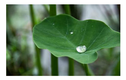
Figure 1. Taro Leaf

Colocasia esculenta , commonly known as taro, is a tropical plant grown primarily for its edible corms. Probably native to southeastern Asia, whence it spread to pacific islands, it became a staple crop, cultivated for its large, starchy, spherical underground tubers, which are consumed as cooked vegetables, made into puddings and breads. The large leaves are commonly stewed.